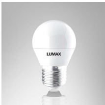
ECO BULB B45 E27