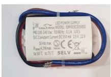
Driver 3Vdc 350 mA