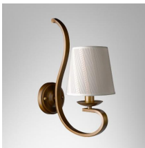
Wall mount Luminaire