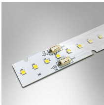
LED Strip Module