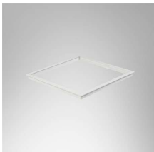
Concealed Ceiling Frame 600x600mm.