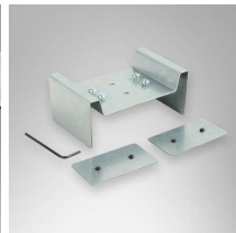
Luminaire connector (continued)