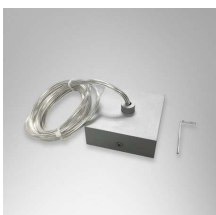
Box with Transparent Wire 1.5m