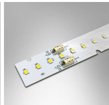
LED Strip Module